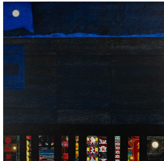
Left: Supachai Areerungruang, Dust & Endurance , 2025, Oil on canvas, 100 x 100 cm