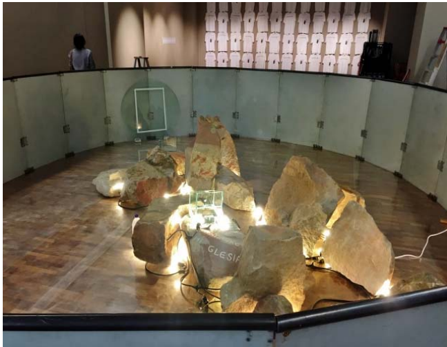
Tang Da Wu Brother's pool (麦脑池) 15 rocks, 24 metal panels and light bulbs 7m across 2011