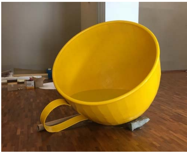
Tang Da Wu One people (一滴水) Metal cup and water 160cm x 180cm x 155cm 2017