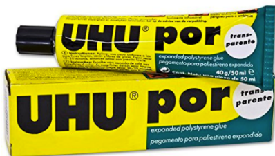
UHU Por glue