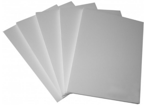
Compressed foam board