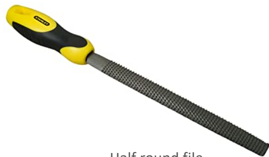
Half round file