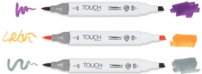
Marker with Fine Tip & Chisel Tip