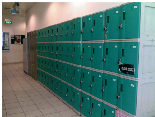
Medium Locker S$35