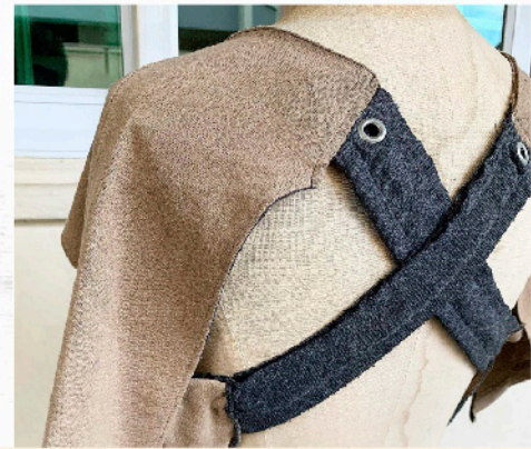
All apparels shown are created by alumnus Alfri Yusoff