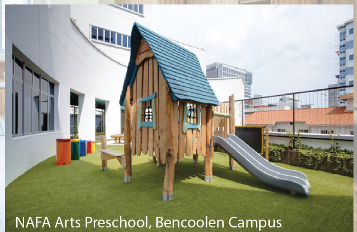
NAFA Arts Preschool, Bencoolen Campus