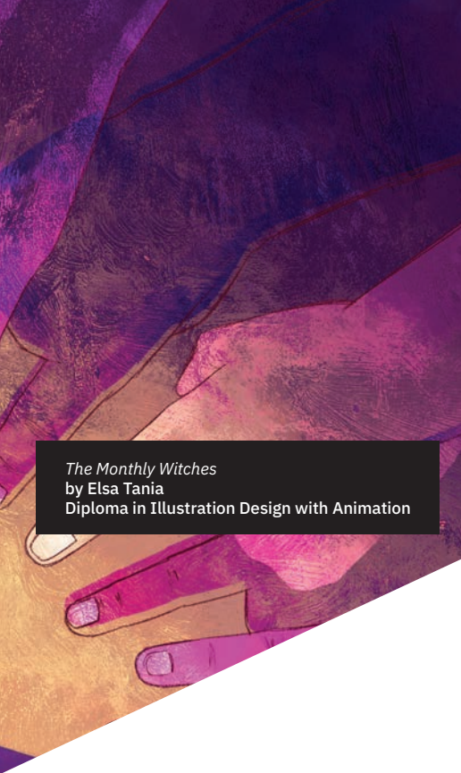
The Monthly Witches by Elsa Tania Diploma in Illustration Design with Animation