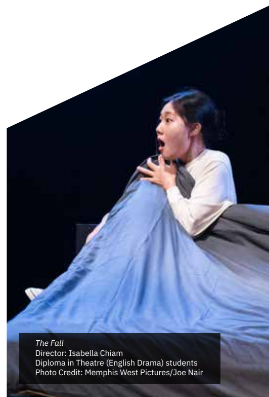
The Fall Director: Isabella Chiam Diploma in Theatre (English Drama) students