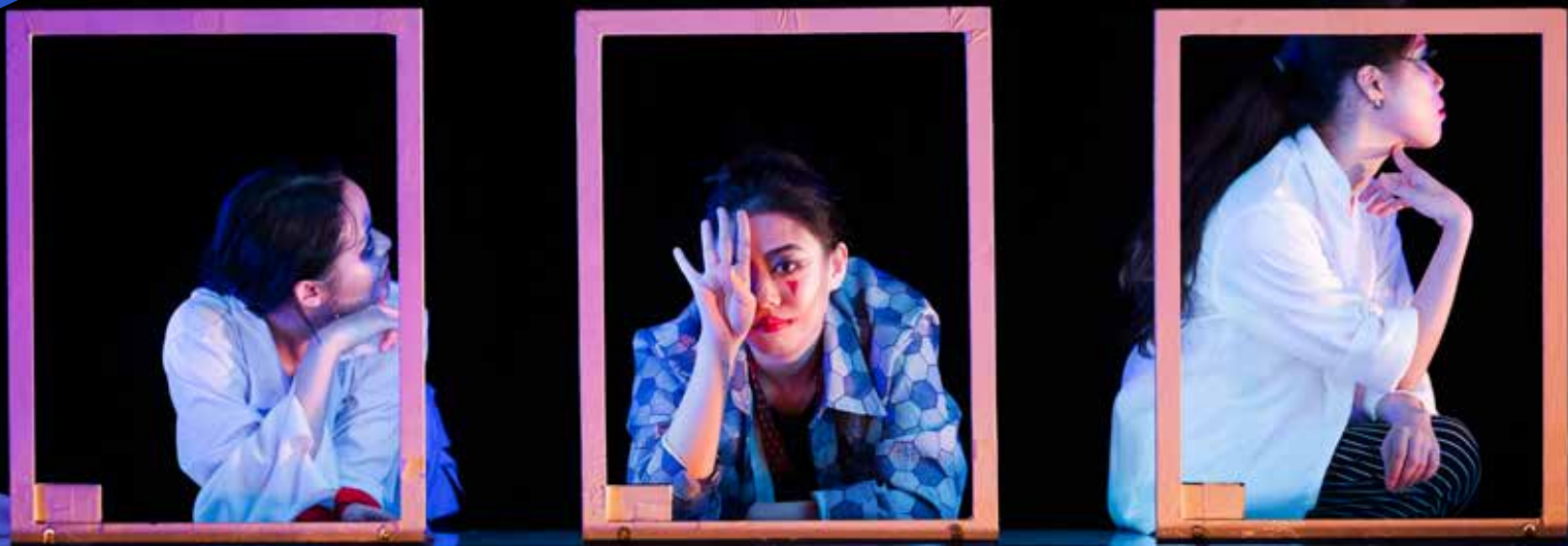
Tompang Devised Work & Cast: Year 3 BA (Hons) Performance Making students

Build collaborative skills and an interdisciplinary mindset that will help you navigate demanding professional environments.