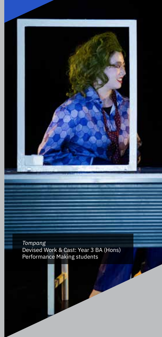
Tompang Devised Work & Cast: Year 3 BA (Hons) Performance Making students