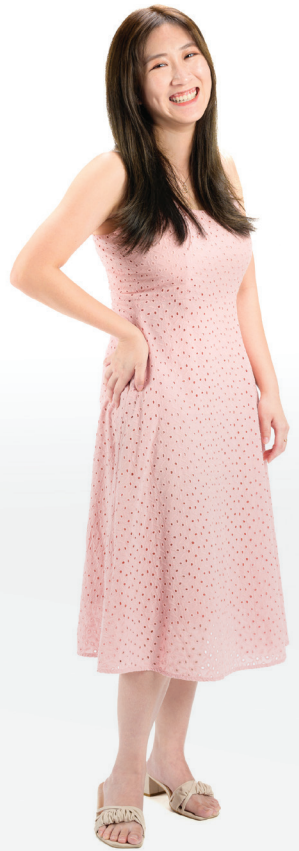
Wong Yun Ting Diploma in Design (Landscape and Architecture)