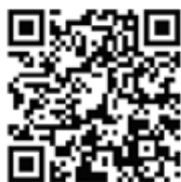
Privileges & Discounts