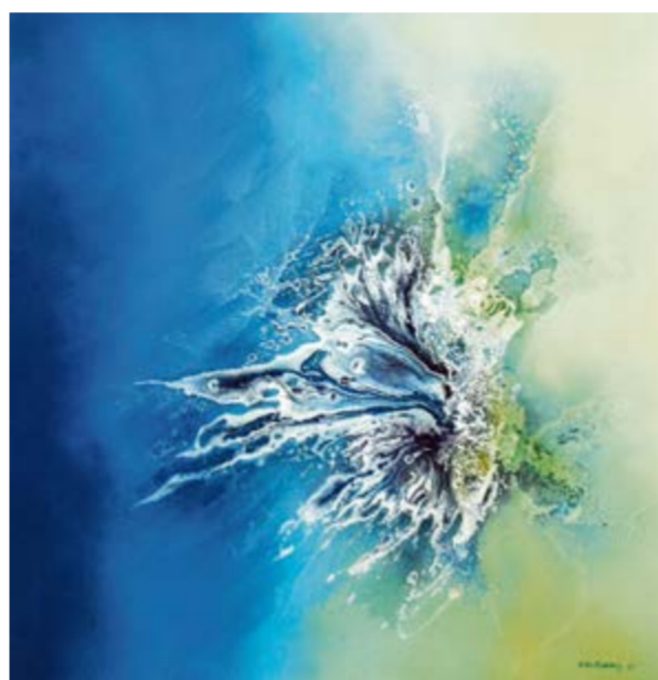
GALAXY 2978 BY THANG KIANG HOW, 71 (acrylic on canvas, 2016)

"I prefer simplicity now that I am older. I enjoy creating large, abstract oil paintings. Composition is what I hope to express: using colours and the illusion of shapes and contours to express a balanced and comfortable composition."