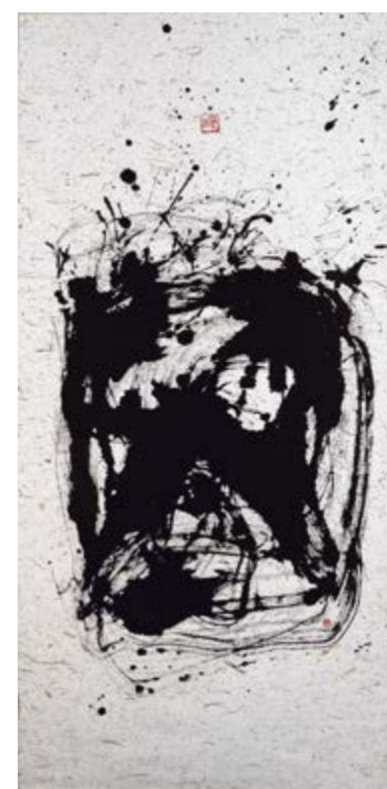
ABSTRACT CALLIGRAPHY BY SIM PANG LIANG, 77 (ink on paper, 2016)

"Galaxy 2978 uses a singular shade of blue that is a personal favourite of mine. I use brush and air spray painting techniques. It allows me to be inventive in my expression of colours."