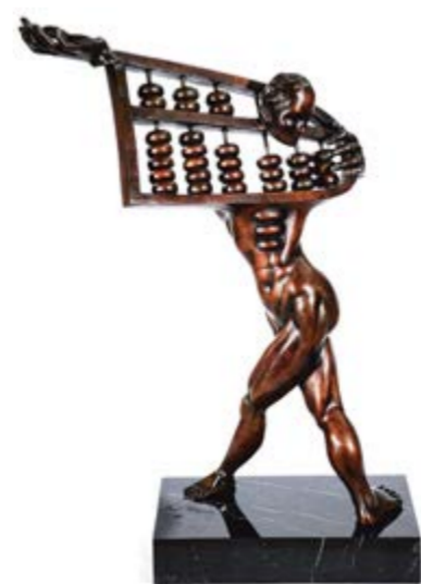
ARITHMETIC BY LIM LEONG SENG, 67 (bronze, 2010)

"Painted in the spirit of Abstract Expressionism. I currently paint in oils and acrylic for their vibrant colours and expressiveness."