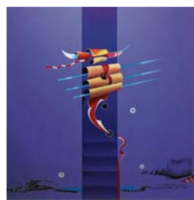
AFLOAT BY TAY CHEE TOH, 76 (acrylic on canvas, 2015)

"This series represents the harmony of the multireligious and multicultural society in Singapore. The two environments that best portray this Singapore Spirit are coffee shops and hawker centres."