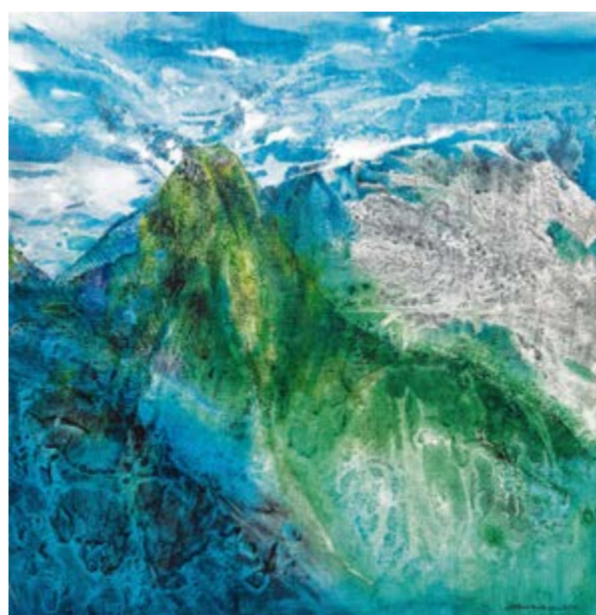
MAJESTIC LUSH LANDSCAPE BY SWEE KHIM ANN, 82 (acrylic on canvas, 2015)

"My later works have become brighter and vibrant. Bull Jump represents a bullish spirit. The warm colours used for the background depict the raw energy and hustle and bustle of a city."